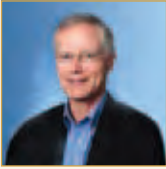
Scott Cook, founder of Intuit