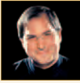
Steve Jobs, founder of Apple Inc