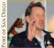
Larry Ellison, founder of Oracle Corporation