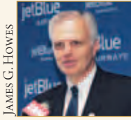
David Neeleman, founder of JetBlue Airways